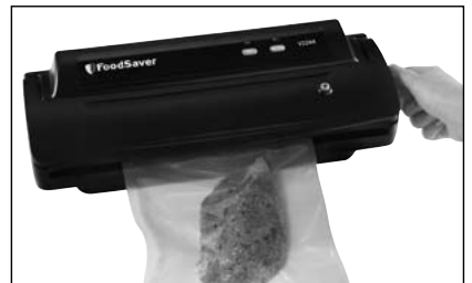
Close and Latch Lid