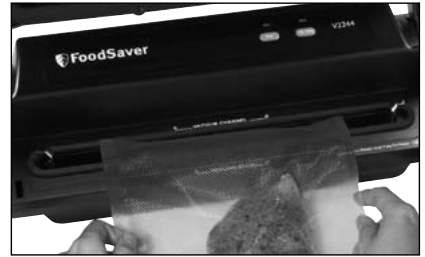
Place Bag on Sealing Strip

Now you are ready to vacuum package with your new bag (see next page).