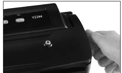
Close and Latch Lid