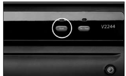
Press Seal Button