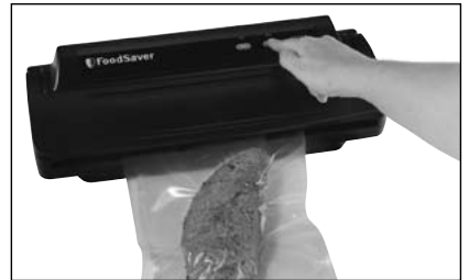
Press Vacuum & Seal Button