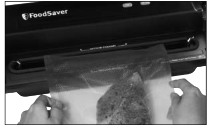
Place Bag in Vacuum Channel

Note: Let appliance cool down for 20 seconds after each use. Always store appliance with the Latch in the unlocked position.