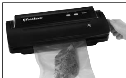
Close and Latch Lid