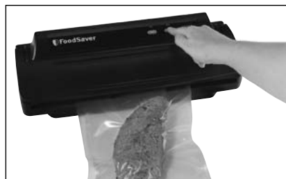
Press Vacuum & Seal Button