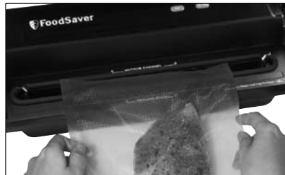
Place Bag in Vacuum Channel

Note: Let appliance cool down for 20 seconds after each use. Always store appliance with the Latch in the unlocked position.